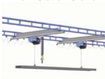
Work Station Crane