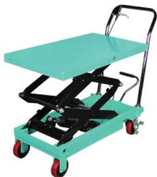
Ergo Sol Lift Table