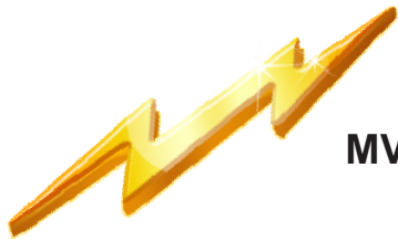
MVC Multivolt Charger Three Phase

All the ENERGIC Plus battery chargers are built under ISO 9000:2000 Quality System and they are CE and EMC certified and all the models for the North American market are C CSA US listed.