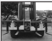
SPECIALIZED CARRIAGE OPTIONS