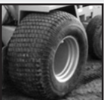
FULL RANGE OF FLOATATION TIRES