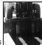
NEGATIVE LIFT MASTS