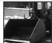
UTILITY BUCKETS AND BLADES